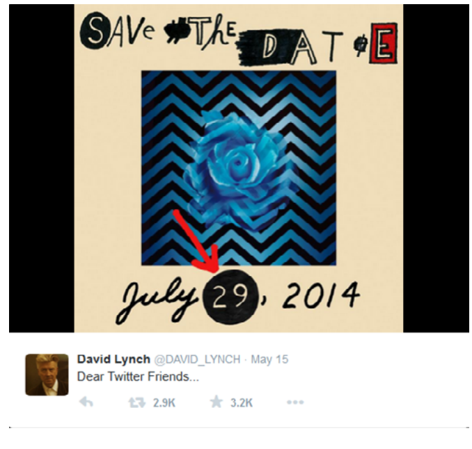
FIGURE 3: LYNCH’S OFFICIAL TWITTER ACCOUNT MARKS THE BLU-RAY RELEASE DATE AS A ‘BLUE ROSE DAY’.

Further alignments between Twin Peaks and discourses of ‘quality’ arose from this image due to the connections it made between the series and contemporary trends concerning transmedia storytelling. Jenkins (2006: 95-6) has argued that “a transmedia story unfolds across multiple media platforms, with each new text making a distinctive and valuable contribution to the whole” and, writing specifically in relation to television, Mittell (2015: 292-318) has further posited that